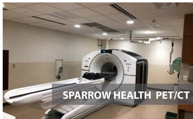
SPARROW HEALTH PET/CT