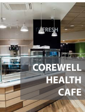
COREWELL HEALTH CAFE