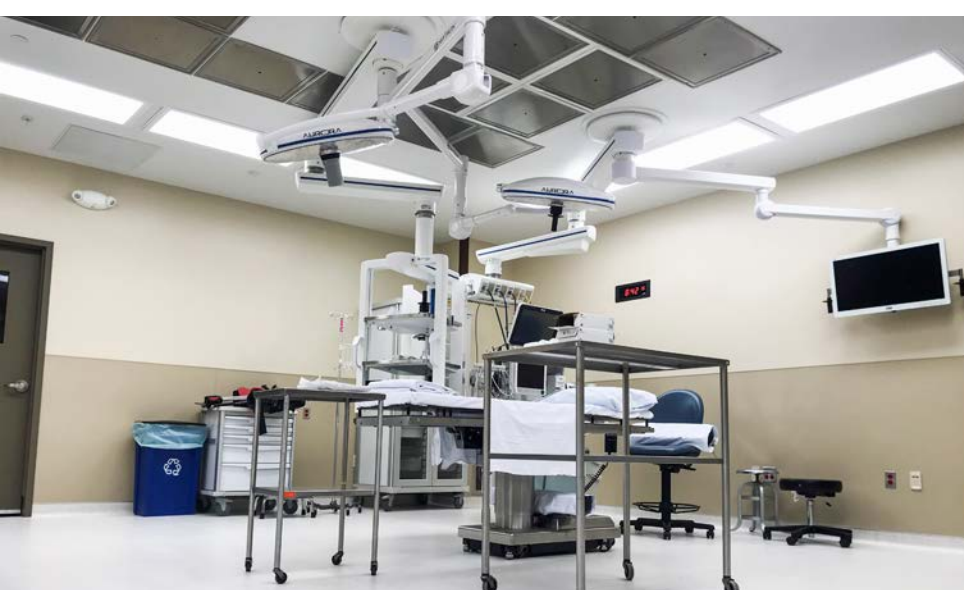
COREWELL HEALTH BUTTERWORTH