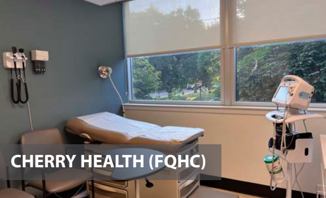
CHERRY HEALTH (FQHC)