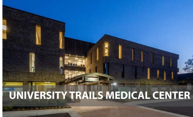
UNIVERSITY TRAILS MEDICAL CENTER