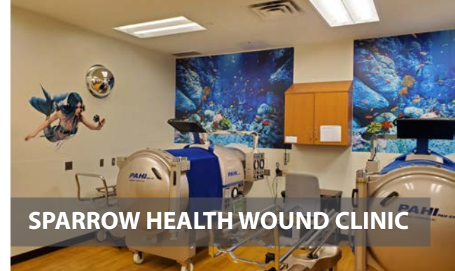
SPARROW HEALTH WOUND CLINIC