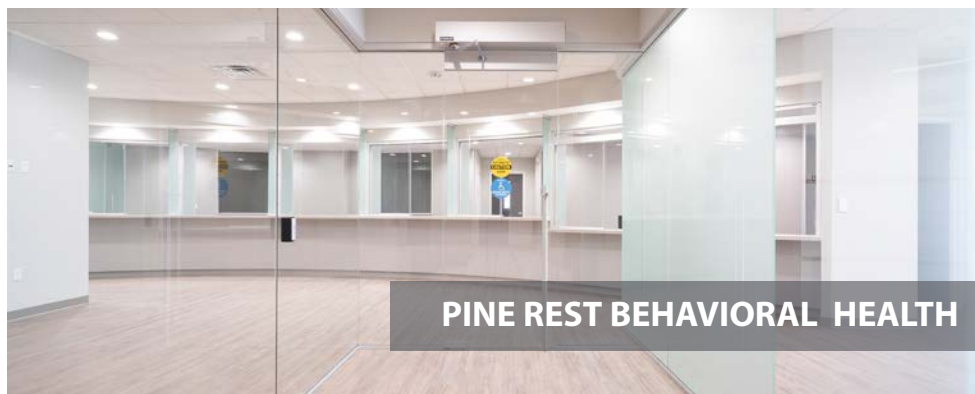
PINE REST BEHAVIORAL HEALTH