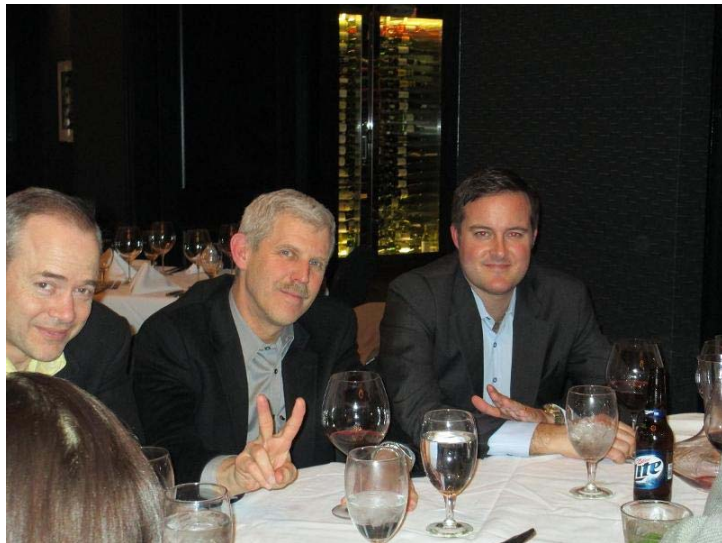
Legislative Day attendees

debate and discussion was the richer for the different viewpoints and backgrounds.