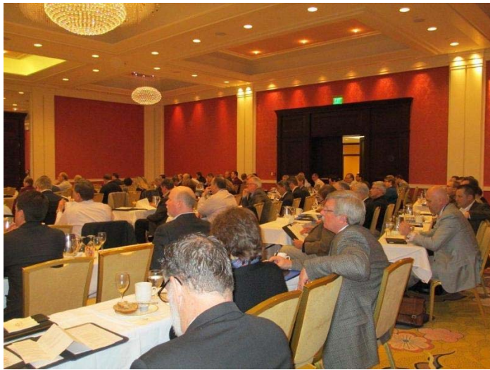
Health Facilities attendees