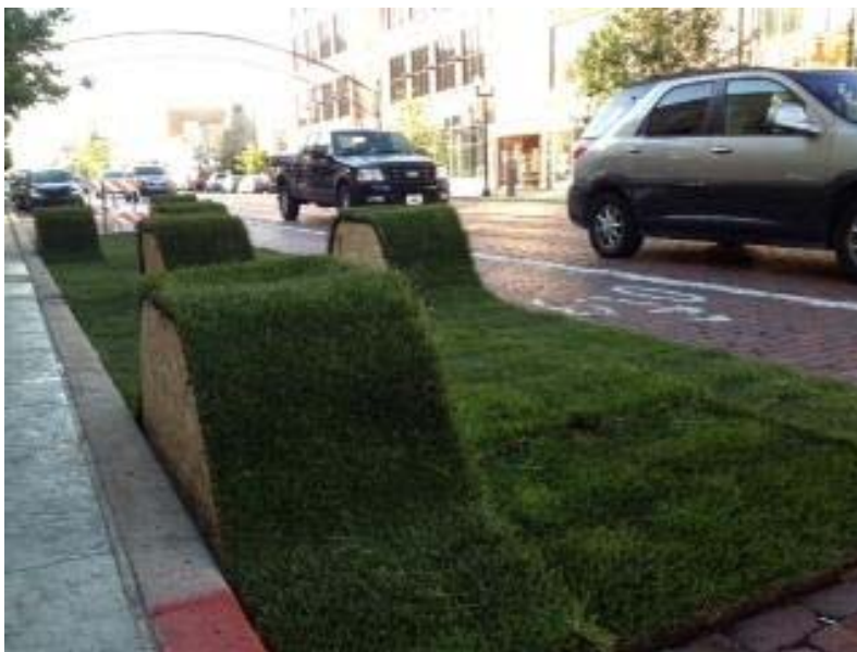
This streetscape intervention explores the concept of what it means to have public green space. The design visually expresses the fun and functional enjoyment of the undulating verdant lawn.