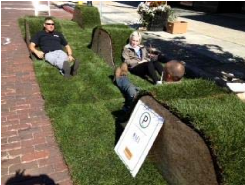
This year's 2013 Parking Day installation was designed by the emerging professionals at Sedgewick & Ferveda Architects and sponsored by AIA Flint.